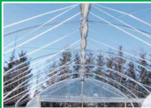
Poly rolled at peak and securely stored