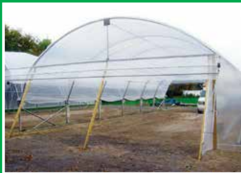
Full length roll-up on gable end, up to 250 ft long