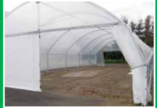
50-50 curtain door