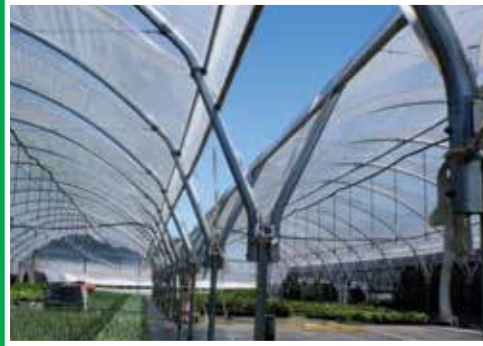
42" high roof roll-up, up to 300 ft (up to 2 per bay, one on each side)