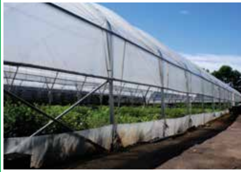
Side roll-ups up to 300 ft

TunnelPro is offered with several value-added options, to customize the tunnel to the specific crops produced. The unique poly storage kit keeps the plastic film covered when it is not needed. It is also ready to unroll quickly when the need for protection arises, saving time and labor.